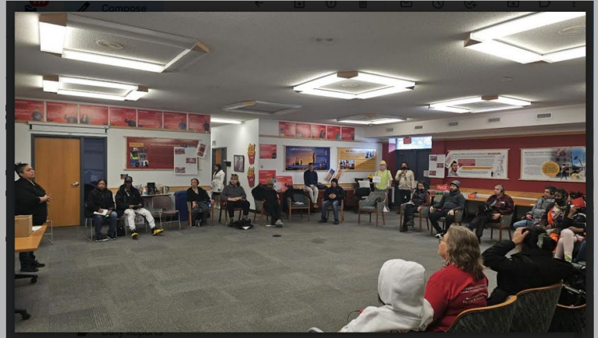
CTUL worker meeting discussing issues that plague the industries that members work in.

Results in more information for investigators on cases due to the expertise community partners have in certain industries, communities, and specific methods used to steal wages.